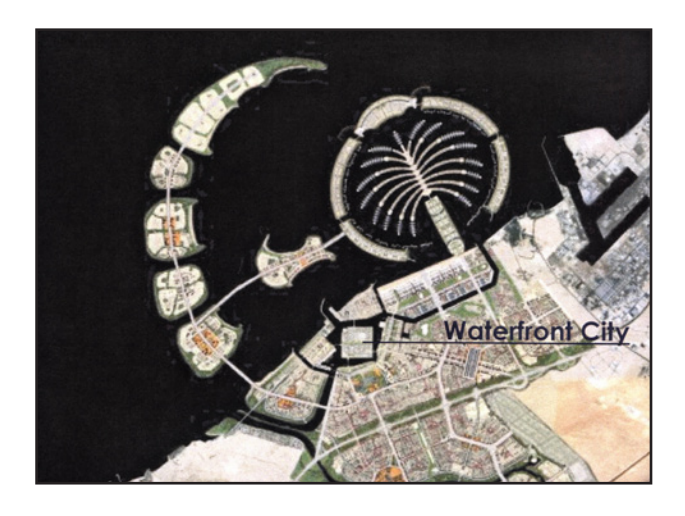
Figure 4: Waterfront City within its larger context.

At the other end of the spectrum, we can think of Alejandro Aravena and his "Project" of ELEMENTAL,