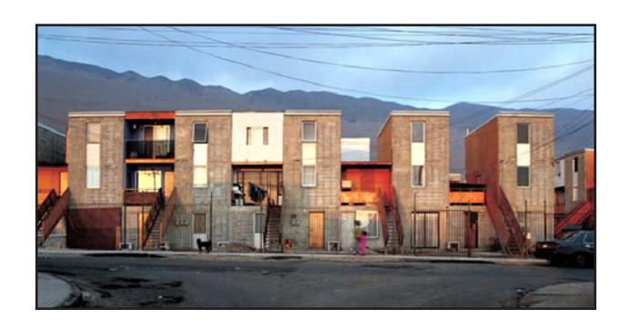
Figure 5: ELEMENTAL Project "at work". Iquique, Chile, 2004-06.

a building system/socio-political strategy/research forum to address the problem of low-cost housing in Chile: "[Elemental is] A 'Do-Tank' operating the city as a source of equality".16 Offering true "design intelligence" to the cause of low-income people for a practical, rational, pragmatic alternative solution to the easy, but costly, and unsustainable in the long term, policy of low-income housing neighborhoods moving ever further from the city proper, Aravena shows us an architecture with a "Project". Instead of "critical architecture", ELEMENTAL could be better defined as a "critical Project". It emerged not by "simply doing", but out of a theory of architecture as an intellectual practice with social obligations and cultural aspirations. It is a (system)design-project that is also a social critique to the traditional way of addressing the housing needs of the poor.