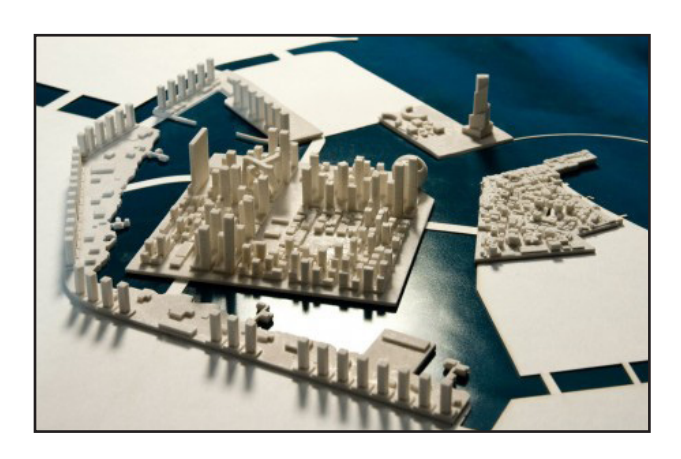
Figure 3: OMA, Waterfront City, Dubai/Abu-Dhabi, 2008. Masterplan.

relevant than ever. The complexities of contemporary practice demand not only strategic realism, but also critical discernment and conscience. Indeed, while architects have a minimal responsibility to do no harm, they may also aspire to do some good." (Ockman 2009, 27)