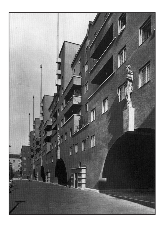
Figure 2: Karl Ehn, Karl Marx Hof, Vienna, 1926-30

instrumental to late capitalism, this needed not be its only result, nor did this mean that the architect should have retreated into contemplative games." (Ghirardo 2002, 41).